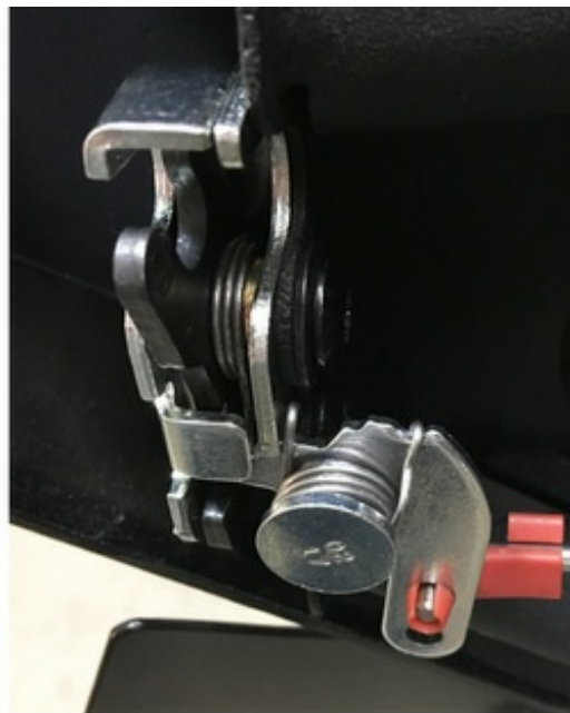
LATCH STYLE B