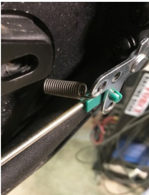
LATCH STYLE A

The Can-Am® Maverick X3 has two different latch styles. Depending on the type of latch you have will dictate where your installation begins.